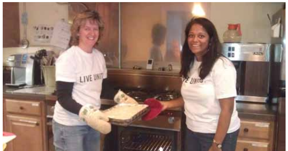
Rhino Foods employees Live United through volunteer service

Watch our website www.unitedwaycc.org in March for additional ways to recognize those who improve the lives of others through volunteer service.