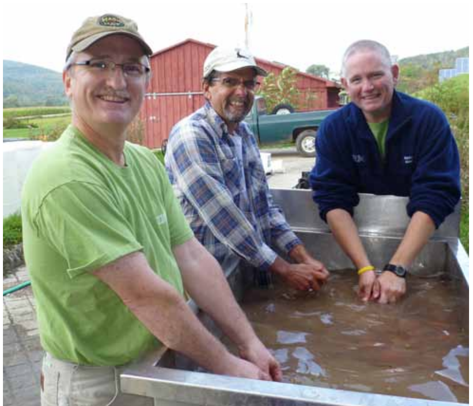
IBM'ers clean up after a great day volunteering

Kitchen volunteers prep & process food for distribution and do inventory and labeling. Must be physically able to stand and lift up to 30 lbs. Shifts are from 9 am-8 pm. Volunteers may come once or as many times as they wish, and groups of up to 8 are welcome (must be scheduled ahead of time). Barre. Community Repack volunteers sort donated food and non-food items, put the sorted boxes into the inventory and may pack food boxes for elderly Vermonters. Volunteers must be able to be on their feet for up