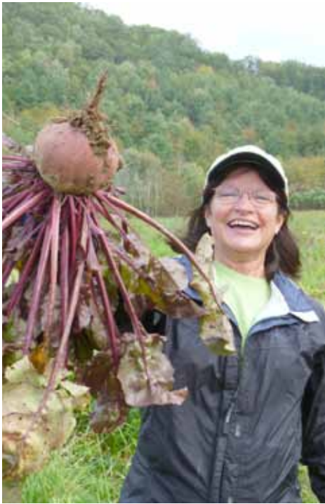
IBM volunteer pulls up the biggest beet for VT Youth Conservation Corps

to 1 hour and be able to lift 30 lbs. Individual volunteers work weekdays 8:30-3:00, but groups of up to 25 can schedule evening or weekend work.