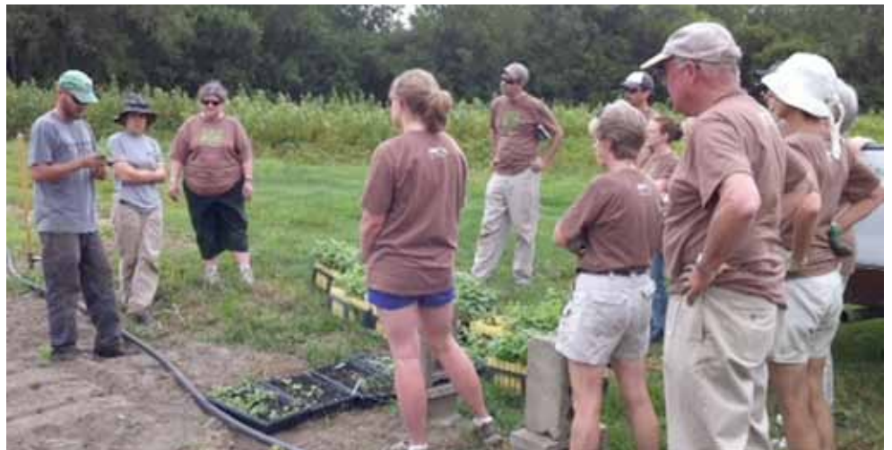
Fletcher Allen Health Care Communications & Marketing team gardening at the Intervale

If you'd prefer to receive this publication via email contact us at volctr@unitedwaycc.org