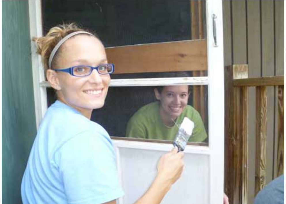
Camp Hochelaga gets a facelift from the IBM Team

Employee giving, combined with skills based and pro bono volunteerism, continues to rise as the local business community in Chittenden County mobilizes to fill critical gaps in our community needs. Employees from companies large and small are helping children, youth and young adults achieve their potential; working to meet basic needs of all people and promote financial stability; and providing the opportunities for all people to get the health care they need. These socially responsible employers understand the value of encouraging their employees to both give generously, and to use their workplace talents and skills to enhance the ability of community organizations to be more effective, both ensuring a stronger community