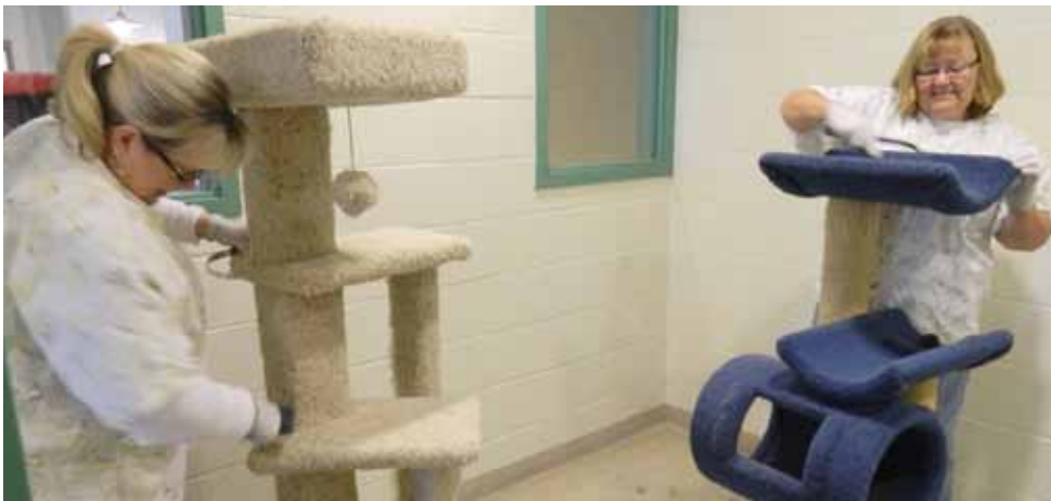
The Rhino Foods team cleans up at the Humane Society

United Way advances the common good by creating opportunities for a better life for all.