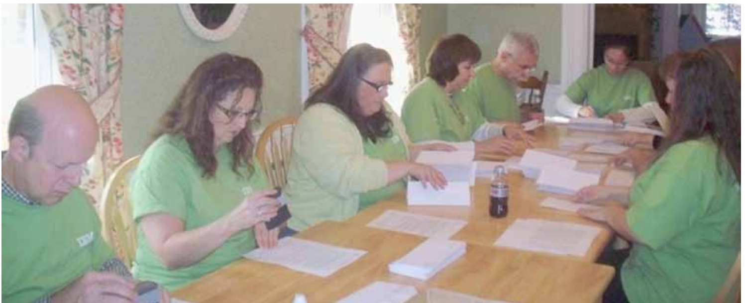
IBM volunteers at the Ronald McDonald McRaffle mailing