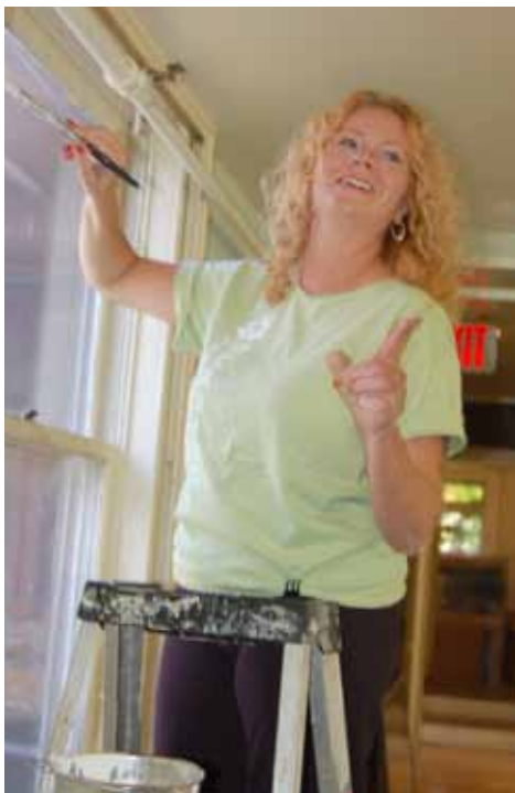
Merchants Bank lends a hand to spruce up Burlington College

for us all. United Way of Chittenden County works with these companies every day. We start by hearing from the company what their community engagement goals are, then help them build a specific workplace campaign and volunteerism plans that meets these goals.