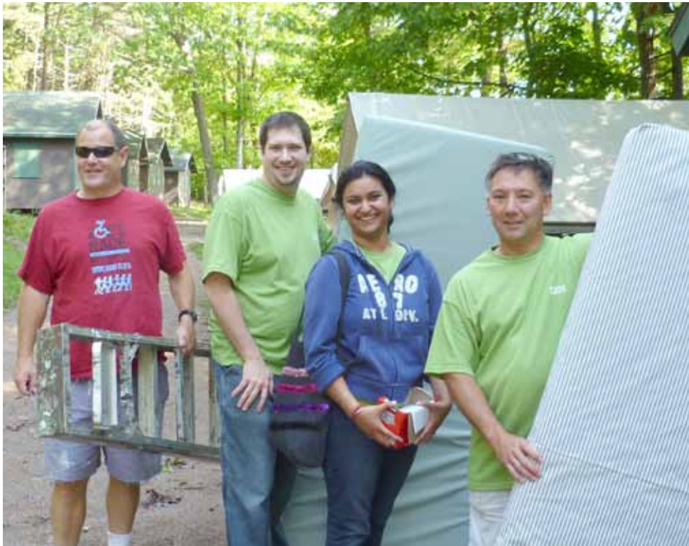
Team IBM volunteering together for Camp Hochelaga